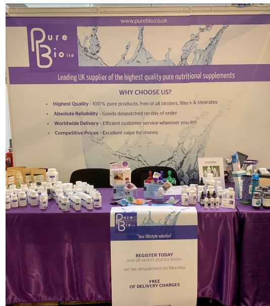
The Pure Bio stand at the Get Well Show

For more photos please see our latest news page on our website